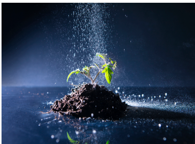
FIGURE 2 | The co-crystals of the novel fertiliser (symbolized here with gypsum) release their nutrients much more slowly.

The starting materials urea and gypsum were placed as powders in a grinding container containing two steel balls. By shaking, the powders were ground smaller and eventually combined chemically. The team used the bright X-ray light from PETRA III to observe the reaction live at beamline P02.1 using in-situ powder X-ray diffraction. The different reaction temperatures and water content of the gypsum were taken into account for process optimization.